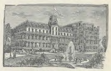
Third, or Present Building.

This grand result has not been achieved by sensational advertising. Very little advertising has been done. The managers have depended upon the recommendations of those who have visited them, whose interest for their sick friends naturally leads them to call their attention to the merits of meth-