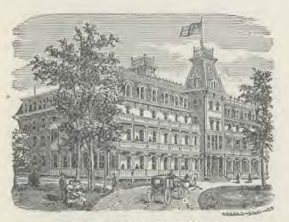
Second Main Bui ding.

Very soon the few small buildings of the institution were quite inadequate to accommodate the scores who flocked to its doors for admittance. Although little had been accumulated as the result of the years of labor for the sick, the small profits having been all consumed in caring for