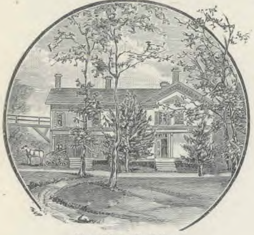
First Main Building.

and suffering, and after a few weeks or months returned to their friends restored to sound health, and informed as to better modes o" living for the promotion of health.