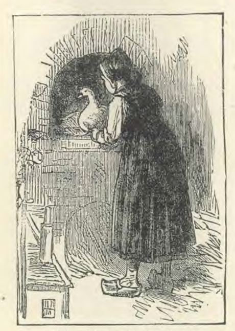
Being Heated in the Oven.

"Why did the 'fattener' watch night and day by our cages with a great knife in her hand? Alas! I too soon discovered. I saw a neighbor of mine in the next cage (he was an old village companion, and we had had many a romp together)-I saw this unlucky. bloated fellow stagger and fall. 'Apoplexy,' I said to myself. I had scarcely murmured the words when the ogress (she was really a pretty young woman, and had a sweetheart who adored her) seized my poor old pal by the neck and cut his head off. He was then hung up in a cool place for twenty-four hours, when his liver, swollen to hideous dimensions, was taken out and sold to a 'piemaker.' The pie-makers give from three to six francs for these livers, according to