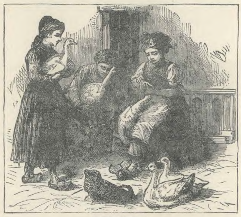
Stuffing the Geese.

"But this pleasant life of liberty did not last long. At the beginning of autumn my master took me to Strasburg, whither one hundred and fifty thousand of my