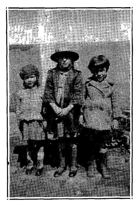
Children in the Bogotá Sabbath school who learned the memory verses for the entire quarter