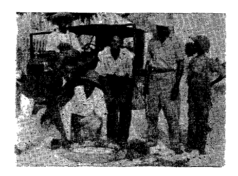
A colporteur experience in Eleuthera

How can any one keep well? We cannot dodge microbes; we cannot sterilize the world. How shall we keep well? We must build the body stronger than its enemies. The best time to fight disease is before we get it. Build up the natural defenses of the body, so that they can ward off and protect us from infection. There is not a possible portal of entrance of disease into the human body that nature has not guarded by strong efficient sentinels. There isn't a disease germ known to science that