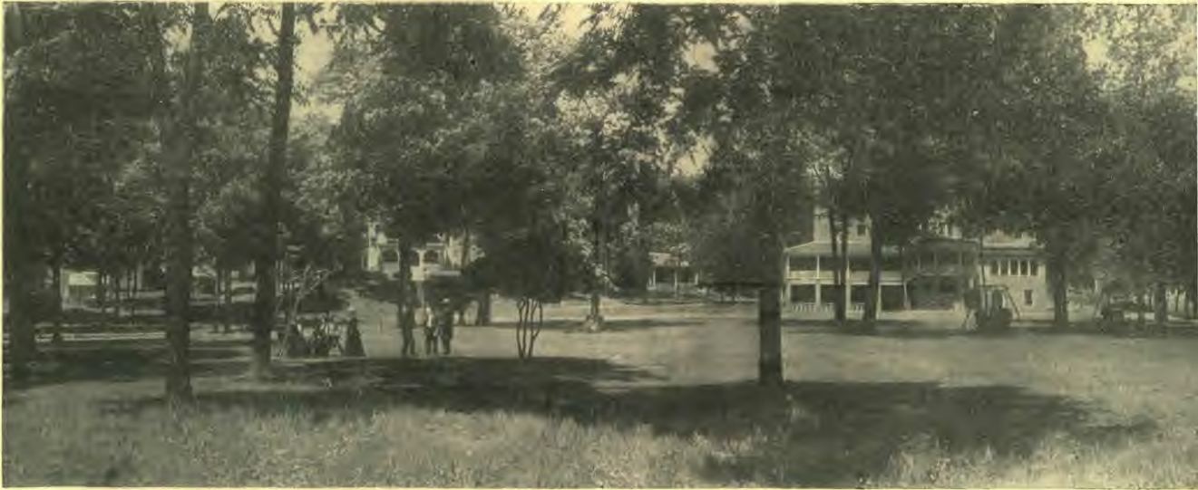
VIEW OF WABASH VALLEY SANITARIUM

The Lord has given us a head to our medical work in Indiana, in our Sanitarium work, and this institution should be used as the right arm of our work, and literature upon