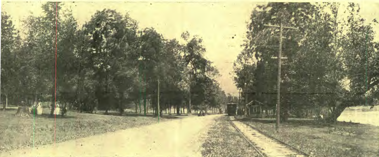
M BUILDINGS AND GROUNDS

The business and professional men who were at that meeting, knowing that the representations made by the Seventh-day Adventists have been exceeded in their fulfillment, have made generous subscriptions towards the good work, and feel that the money so spent will bring good returns from a business point of view to say nothing of humanitarian considerations. The building was made more extensive than was