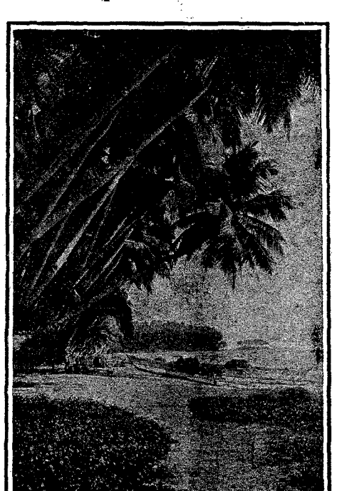
SEASHORE, SOUTH INDIA

at least in name. Many well-equipped hospitals, good schools and churches are in evidence all through the country. The Roman Catholic, London Mission, and the Salvation Army seem to be the strongest missions working here.