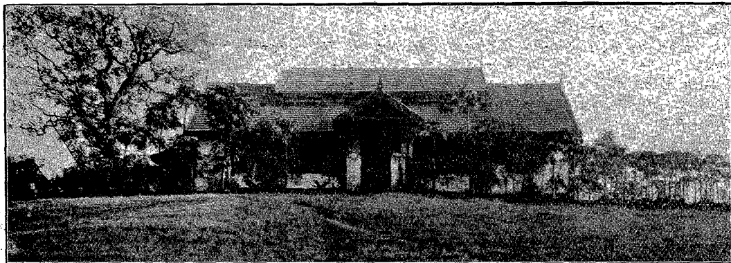
KALYAN MISSION BUNGALOW

The impressions made on my mind during my first visit some eighteen months ago, of the promising nature of the East Bengal field, were deepened during this visit. Readers of TIDINGS will be glad to