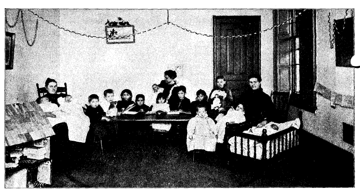
A ROOM IN THE NURSERY

From another report we learn of the case of a poor, colored woman whose husband has forsaken her.