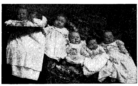
SOME RESCUE-HOME BABIES

He had not been there since the day before the little one was born. No true motive of love had actuated him in the doings of the past; and now, in this trying hour for the one to whom he had pledged his affection and support, he forsakes her,—leaves her