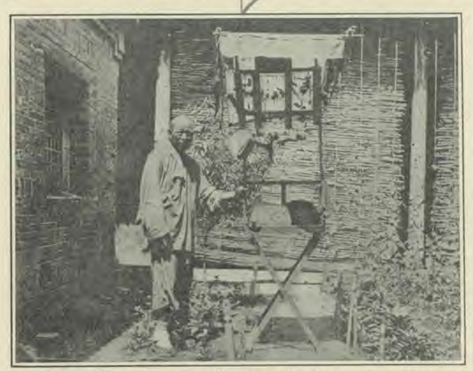
A TRAVELING CHINESE "DOCTOR" AND HIS PORTABLE MEDICINE CHEST

known in his village,- that of the traveling quack, of which the accompanying picture is a good representation. This man has been in this city for several days, and cries at the height of his voice, in a sing-song style, often repeating little strains of poetry, telling the people of the value of the rare remedies he has, and how old some of them are. He usually