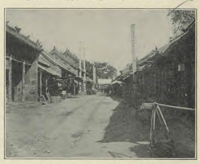
A SHANG-TSI VIEW, MEDICINE SHOP SIGNS

These doctors gather their medicine from every conceivable source, their supply being composed of such things