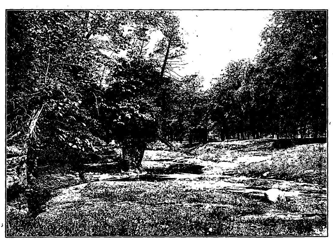
SCENE ON COLLEGE FARM

"I fear that many of our people do not realize the importance of God's work. One to whom I wrote for money answered thus: 'I received your letter asking me to lend you some money. But there was a piece of land that the children thought it advisable for me to purchase, and I have invested my spare means in this land.' How much better would it have been for this brother to invest his money in establishing sanitariums, in which witness is borne to the truth for this time, or in schools, which will provide for our youth