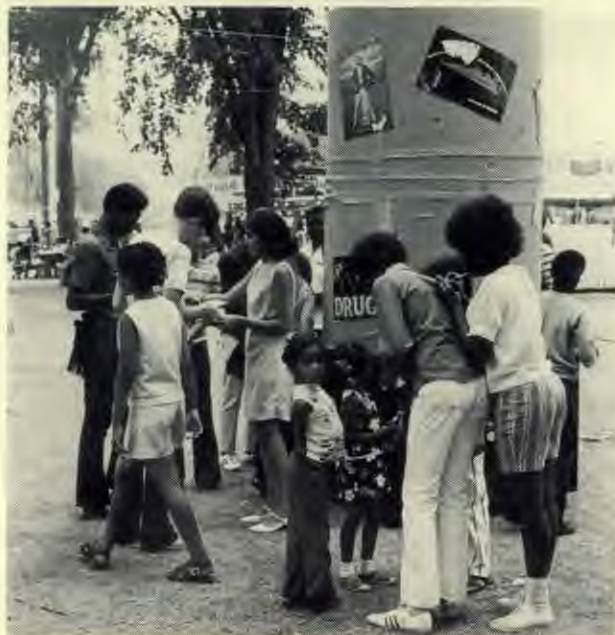
Fairgoers sign up for "Wayout" at Michigan State Fair.