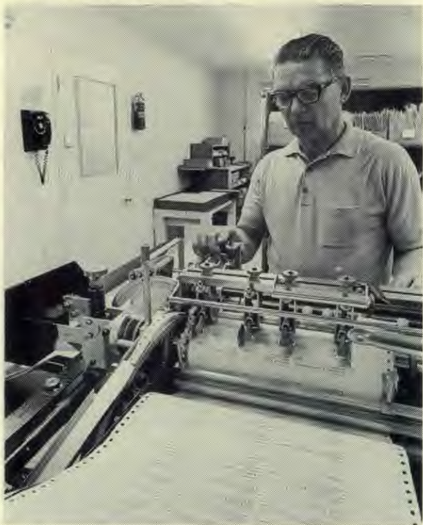
Some 240,000 names flash through the Voice of Prophecy's heat transfer process, being transferred from computer printout to envelopes going to readers of the monthly "Voice of Prophecy News." More than 75,000 new names have been added to this growing print witness during the past year.