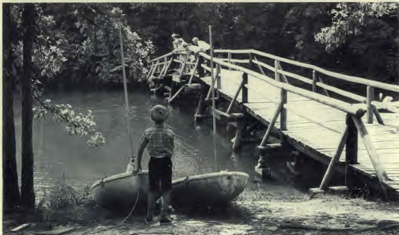
Feeding fish is one of the pleasures of camp meeting.