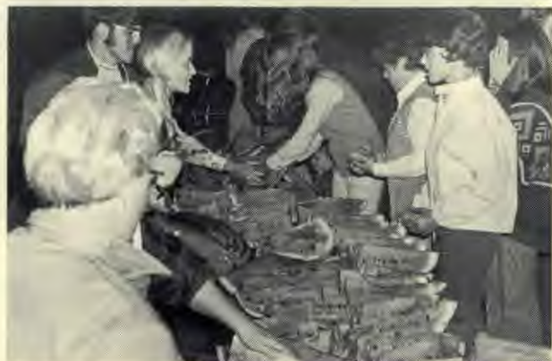
The melon feed shown above was but one of many activities sponsored throughout the school year by the Associated Student Body of Wisconsin Academy.