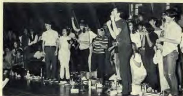
Enthusiasm is the key to success as Wisconsin Academy students begin another school year.

The cylindrical display, as seen in the picture, featured a self-contained public address system which aired spot announcements every 45 seconds. A number of copies of Wayout had been fastened to the surface of the display. Young people from the council mingled with the youthful fair attendants, inviting them to sign up for the new evangelistic material which has been geared to today's youth.