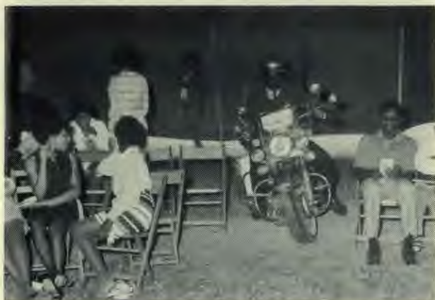
During camp meeting this man made an unusual entry into the youth tent at Cassopolis in order to give a more dynamic testimony up front.