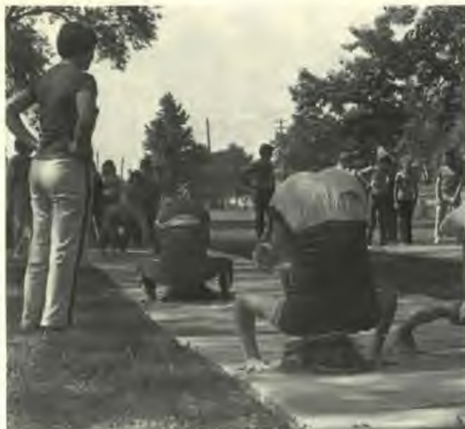
Andrews University Gymnics teach the young people to use their heads.

Special programs were presented by the Andrews University Gymnics, and an ordination service was held Sabbath afternoon, June 10.