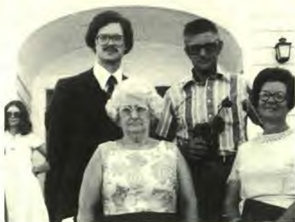
The charter members and families of the St. Elmo Church.