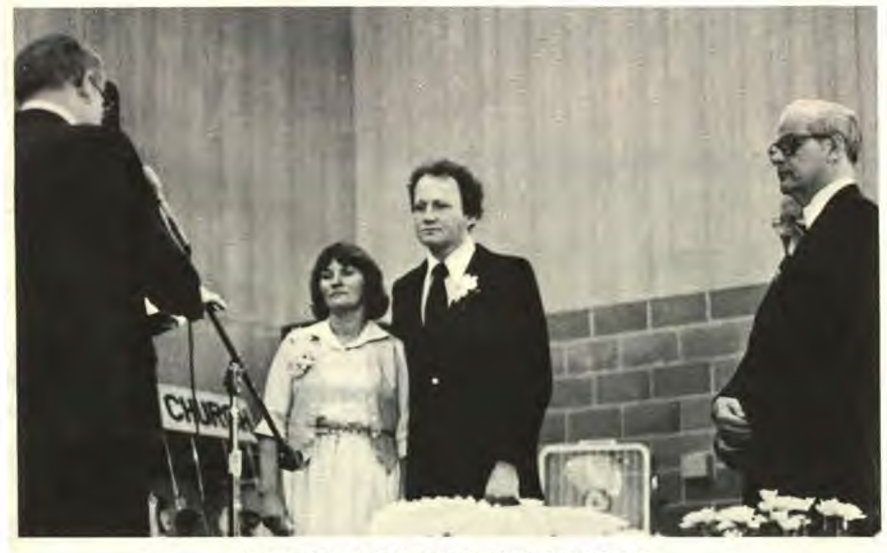
ORDINATION AT CAMP MEETING

The building should be finished by late October. The members are looking forward to a truly thankful Thanksgiving.