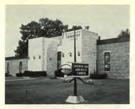
The Moline Church