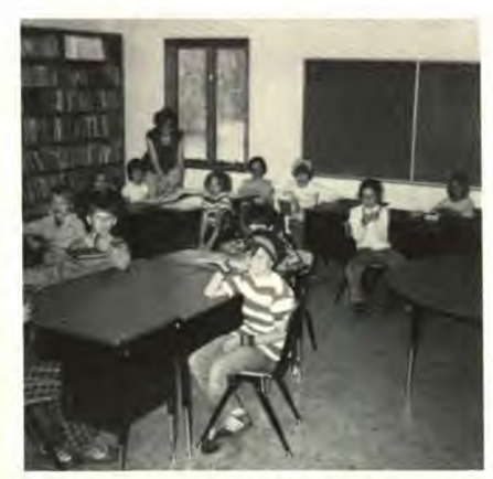
The Wausau Church School has room for all the children.