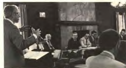
S.D.A. hospital administrators met recently at Hinsdale Hospital.