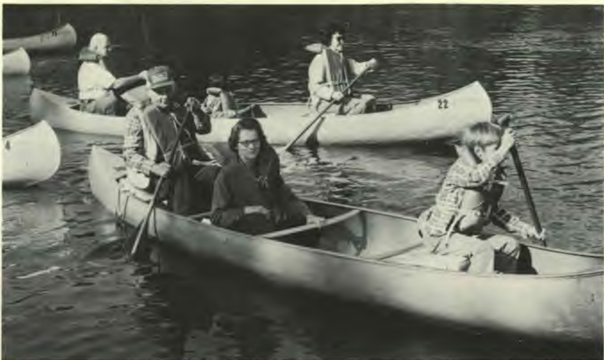
Families arrive at the end of the "canoe trail" made by those attending the Pathfinder leaders camp.