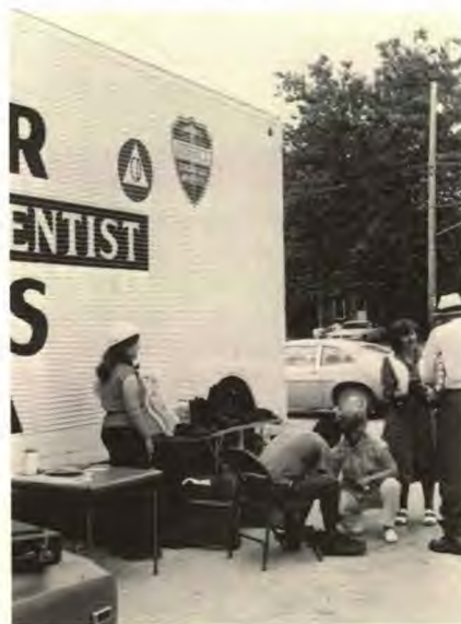
Paoli church members aid flood victims.