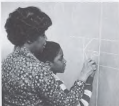
A special offering on April 26 will enable members to make an investment in Christian education and the future of the Adventist church.

It appears the children were to be totally immersed in learning about