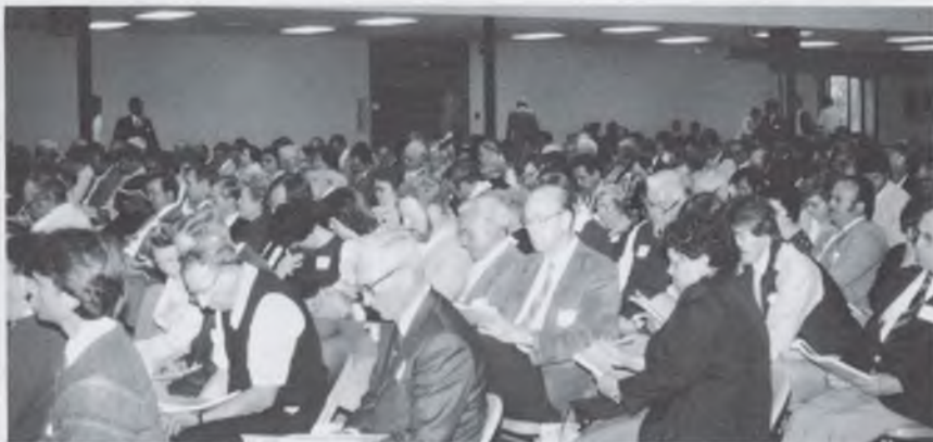
Indiana's 286 delegates met in the remodeled Indiana Academy gym.

tributed nearly $26 to each student account.