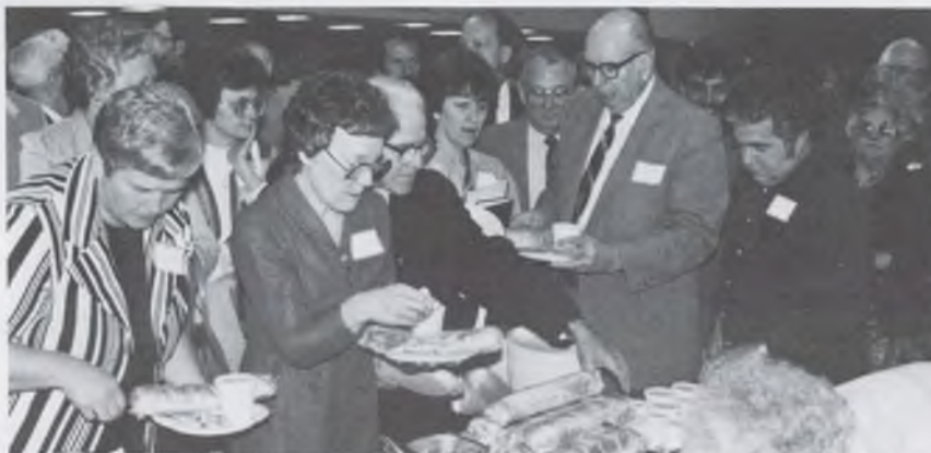
Delegates from 67 churches gathered at the self-serve tables for lunch break. The junior class of Indiana Academy prepared vegetarian hoagies, soup, a beverage and fruit.