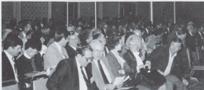
The 16th Business Session of the Lake Union Conference of Seventh-day Adventists was held April 13 and 14 in the Interlaken Lodge at Lake Geneva, Wisconsin. A total of 333 delegates were appointed; 268 registered.