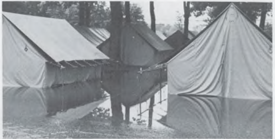
The eleven inches of rain that fell on the Michigan campground flooded tents and produced mud that crippled traffic.

grounds were held on Sabbath and Sunday until noon.