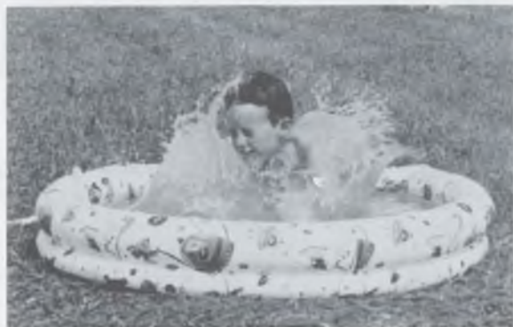
A young camper enjoys cooling off in a pool.