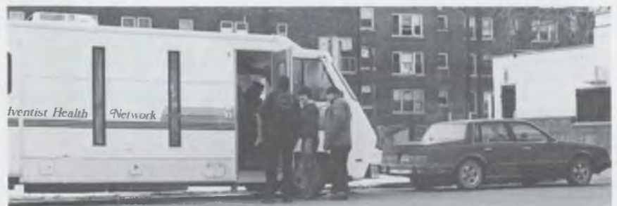
Volunteers in the health-screening van work in the Cass Quarters area of Detroit.

The Detroit/Flint van ministry volunteers continue to minister to be the Good Samaritans on the roads of Detroit and Flint.