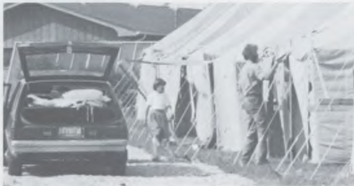
Campers occupied "Ten City" at the Indiana Camp Meeting June 8-14.