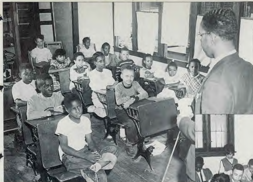
Education has been one of the priorities of the Lake Region conference. Children look much the same in every era, but their surroundings change with the times.