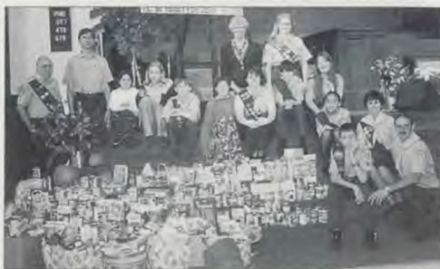
The Battle Creek Tabernacle held a Festival of Praise for the items collected by their Pathfinder Club for food baskets during the holidays.

One family with five children was in real need. The father had worked for a local church member for many years. When that member retired and closed his business, the father was left without a job to support his family. Finally he found a part-time job where he could work 15-20 hours per week at $5.75 per hour. Not a lot to support his family with, but at least it was