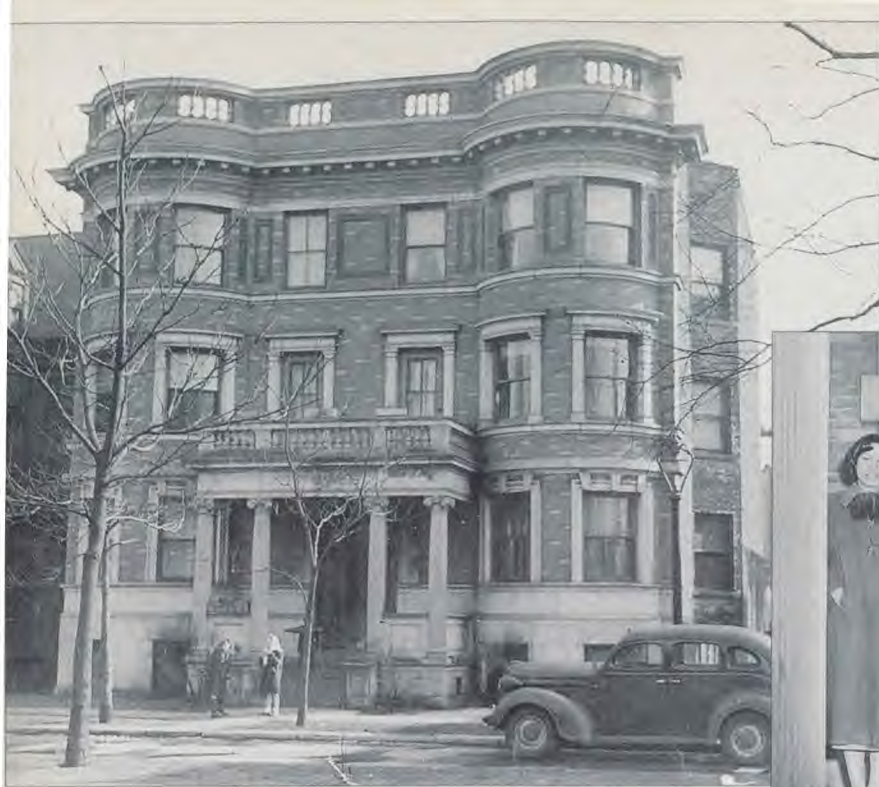
Lake Region Conference offices moved to 619 Woodland Park, Chicago, in 1945.