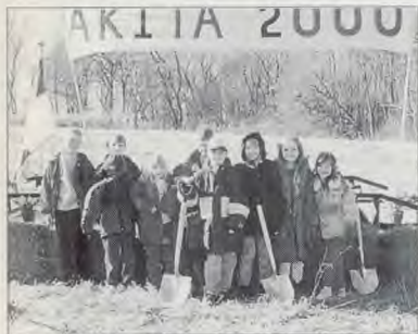
Children were happy to have a part in the groundbreaking for Camp Akita.