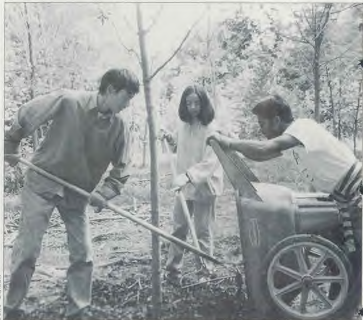
Andrews Academy seniors plant trees as volunteers at the Open Lands Project in Chicago.

FOCUS is comprised of six ladies from Chicago area churches