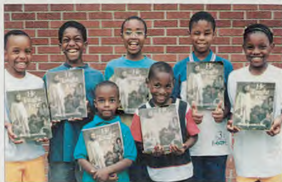
Younger students in the Terre Haute School are learning to share their faith by selling magabooks like big kids do.

Border sheets also serve as wonderful thank-you notes to the supporters and volunteers of the school. Students love seeing the gleam of appreciation on the recipients' faces when the lovingly decorated border sheets are received. This activity has the students begging, "Can we practice handwriting today?"