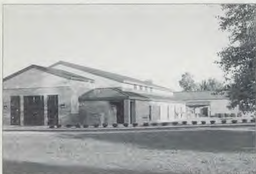
The new auditorium, music, and industrial complex at IA was dedicated last spring.

New Construction —Our new auditorium, music, and industrial complex was dedicated last spring. For several years we have not