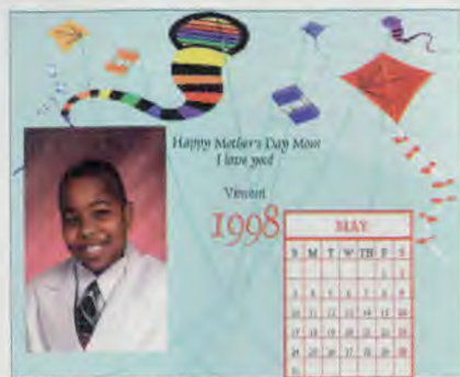
Students at Mizpah Junior Academy use computer graphics for Bible Labs projects.