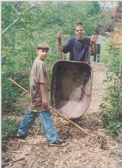
Grand Rapids Junior Academy students made a nature trail through the woods on their school property.

huge tree cut down and ground into chips. Quickly, arrangements were made to have those chips dumped at one end of the trail. Carter talked to city officials, and they agreed to dump another load of wood chips at the other end of the trail. The tenth-grade students began to gather wheelbarrows, rakes, shovels, and measuring tools to begin the job of spreading the chips. Then they asked the students in grades five and six whether they would like to spend an hour the following Wednesday morning helping to spread the chips on the trail. Of course the students jumped at the chance.