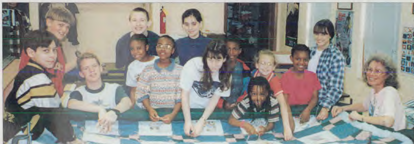
All 13 students at the Terre Haute (Indiana) School participated in making a quilt as one of their Bible Labs projects for the second year in a row. Last year the quilt was given to their new pastor; this year the quilt was given as a special gift to a church member who is a very active supporter of the school.