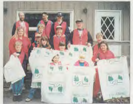
Students in the Grayling School prepare to set out on their Adopt-a-highway project.