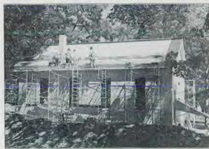
Forty-five Maranatha volunteers came to Battle Creek to build a replica of the 1857 Meetinghouse. The original meetinghouse was the site of many significant decisions as the pioneers struggled to organize the Seventh-day Adventist Church.

The 45 Maranatha volunteers came from each union conference in North America. For several volunteers this was their first Maranatha building project, but most of the people have