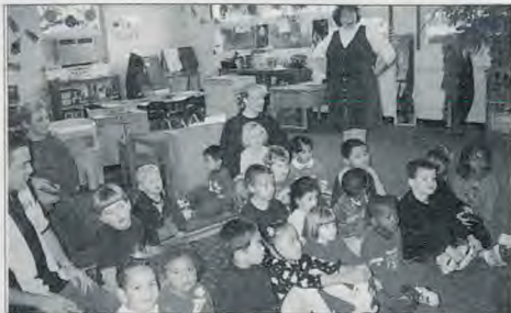
Ann Arbor Elementary School has an active and growing pre-school and kindergarten program.