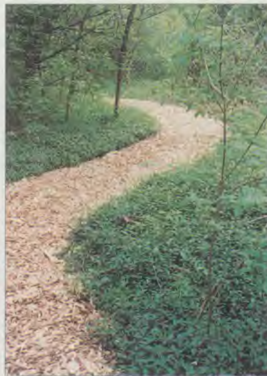
People from the school's neighborhood now enjoy using the winding trail through the woods.

One day one of the older students noticed that a neighbor was having his