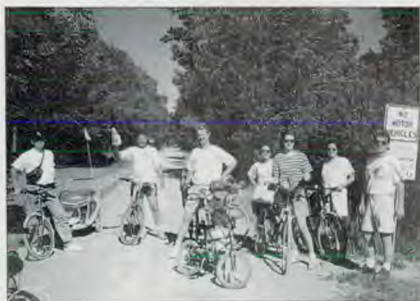
Members of the South Haven Church participated in a bike-riding, fund-raising event to raise funds for the new addition to their church.

The 40 people who participated in the bike ride cycled a 16-mile track. The weather was great, and everyone displayed an excellent spirit of cooperation. Donations from sponsors totaled almost $1,000, which was given to the church's building fund. The church members thanked the local merchants for their excellent support of donated provisions. They also expressed