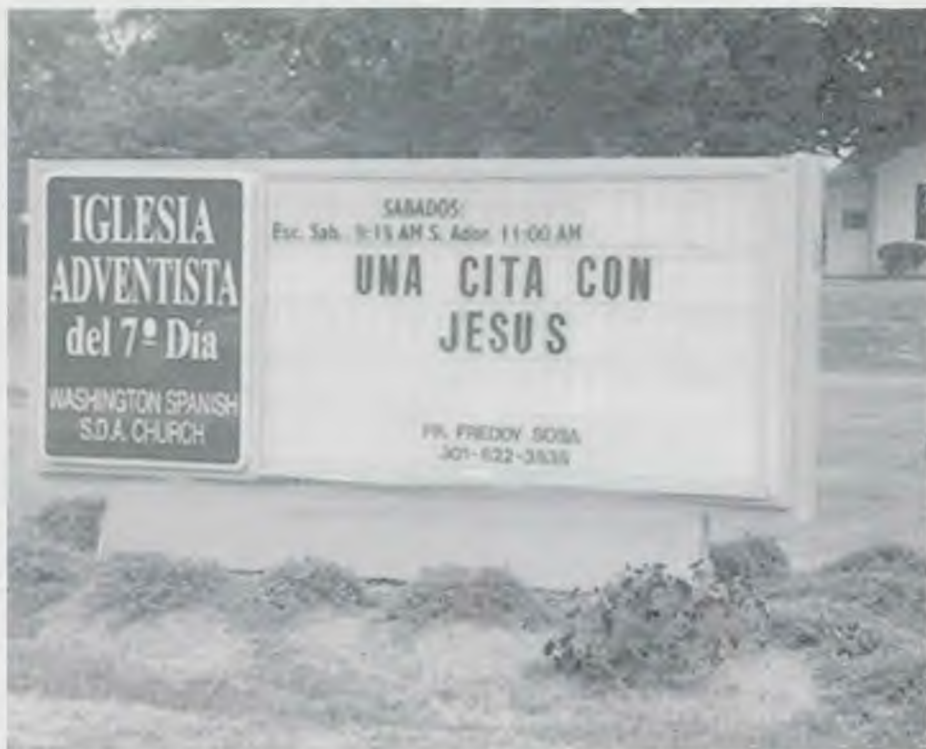
The marquee sign can be made according to your needs. With lighting and changeable lettering, it is ideal for a larger church and can become a great evangelistic tool for the community.

Several years ago, the General Conference communication department led out in the creation of a new