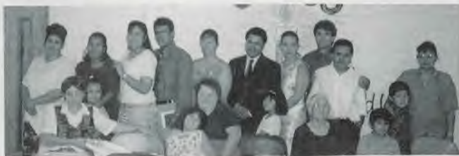
A new group of Hispanics are now meeting in Kankakee, Ill.

for years, and there is now a group of 20 people meeting on Sabbaths. This group had a baptism recently, and two people gave their lives to Christ.