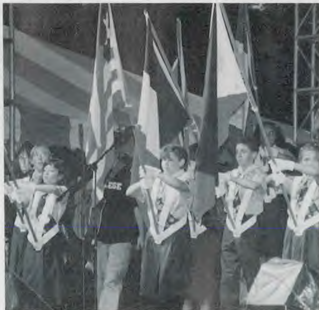
Pathfinders from Berrien Springs, Mich., carried the flags for the opening ceremonies of the Discover the Power Pathfinder Camporee.

Look for a full report of the camporee in the October issue of the Lake Union Herald , and the 4 th quarter No One But You video. If you cannot wait for more information, visit the camporee web site at: www.camporee.org