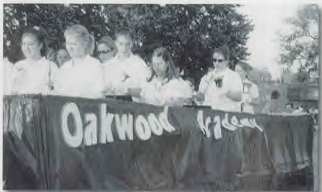
The Oakwood Junior Academy bell choir and kolintang players participated in the Southfield Memorial Day parade, receiving news coverage on a cable news broadcast.