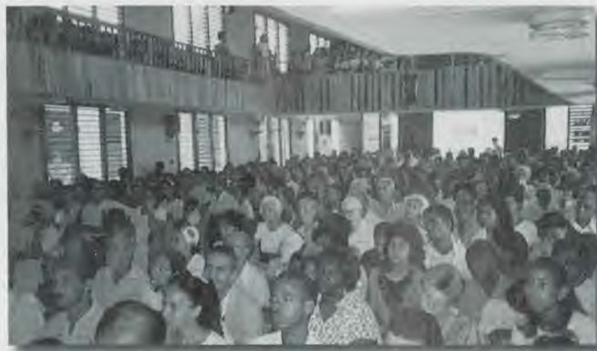
Hundreds attended the meetings each evening, resulting in 26 baptisms and many more decisions to prepare for baptism.