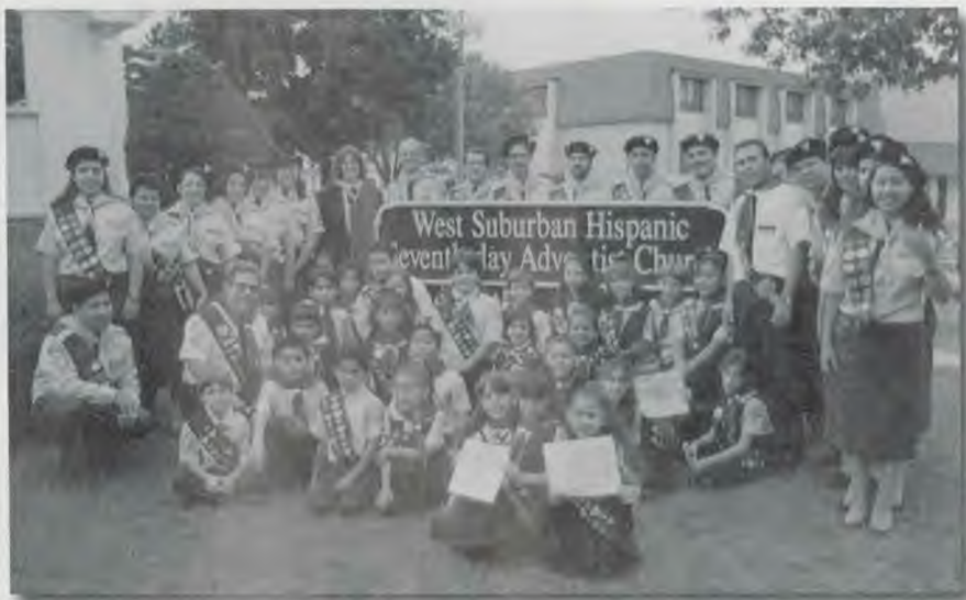
With help from Master Guides from Chicago's Little Village Hispanic Church, the members of the Adventurers Club of the West Suburban Hispanic Church were invested.