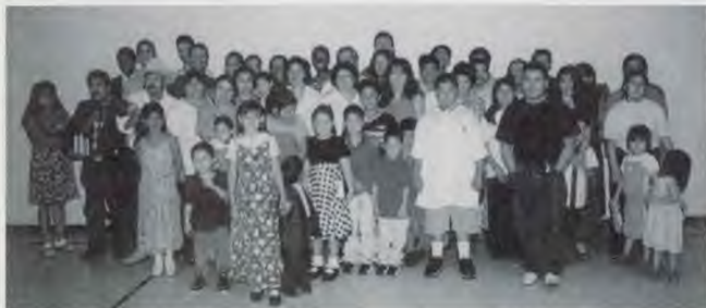
More than 40 people were in attendance for the church service when the Logansport, Ind., Hispanic group met for the first time.