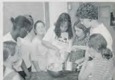
Cooking is but one of the many skills learned at F.L.A.G. camp during the summer.