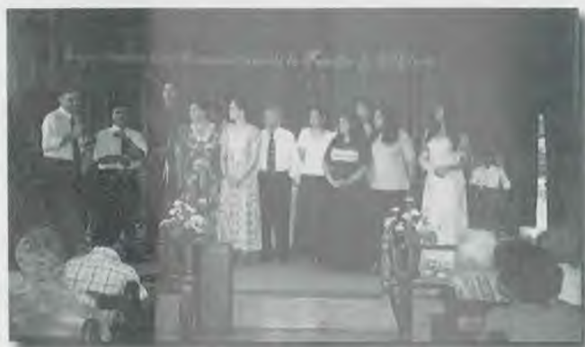
A group of young people from the Berrien Springs Spanish Church went on a mission trip to Cuba.