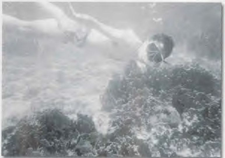
IT WAS AS IF I'D NEVER WALKED OR BREATHED ON LAND!