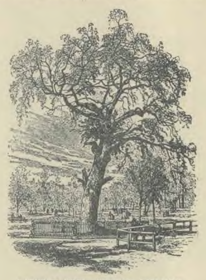
LIBERTY TREE, BOSTON COMMON

to see how generally the persecuted have become in turn persecutors the moment the power was lodged in their hands. And why? — Because the true principle of Christian liberty had not been grasped, and is to this day apprehended by only a few. The right of any body of men to differ in opinion from others has always been claimed by them; there is no novelty in that. From the beginning, every Christian sect that has arisen has vehemently contended for its right to differ from others. But in few cases has any sect conceded the right of others to differ from it, or forborne to persecute when it had the power. And in