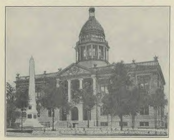
MECKLENBURG (N. C.) COURT-HOUSE; SHOWING MONUMENT TO SIGNERS OF THE FIRST AMERICAN DECLARATION OF INDEPENDENCE

ish us. No other being in the universe has the right to intermeddle in the premises, either for the sake of reward or of punishment. The right of God is equally exclusive of individuals and of societies. If we persevere in disobedience to God, our fellow men may attempt to change our minds, but only in such way as God himself has appointed; that is, by the "manifestation of truth commending ourselves to every man's conscience." If these means fail, the duty of our fellow men to us is accomplished. We must then be left to our own course. Our fellow men are not responsible for us any further. God, henceforth, reserves the case for his own exclusive jurisdiction.