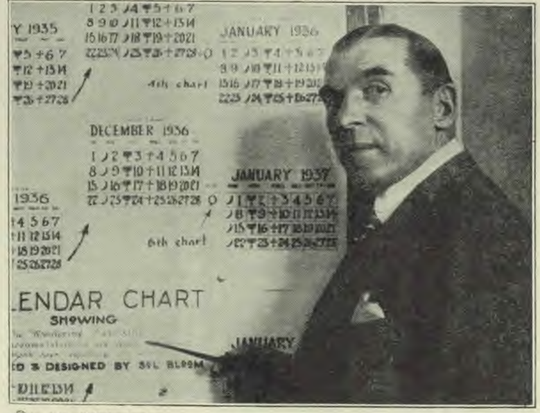
CU. AU. WASH D C.