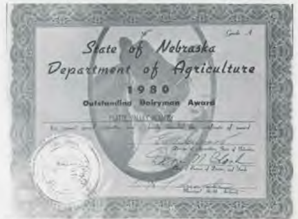
Certificate of special award from State Department of Agriculture.