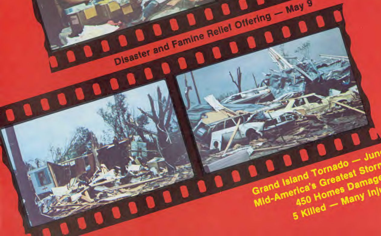
Grand Island Tornado — June 3, 1980 Mid-America's Greatest Storm Disaster 450 Homes Damaged 5 Killed — Many Injured