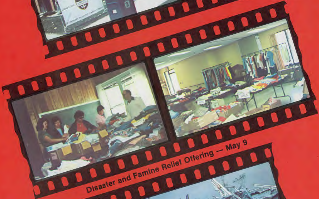
Disaster and Famine Relief Offering — May 9