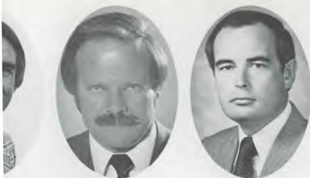
rdson er, ersity