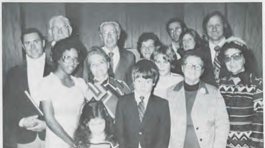
Worshippers at Sedalia