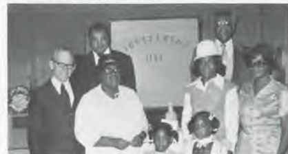
Bethesda members during Investment Program Celebration.

There were group projects as well as individual ones. The primary class saved aluminum cans which were sold to the recycling center. The Kindergarten class brought weekly contributions for Investment.