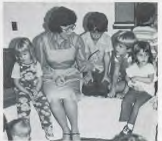
Nursery service provided.