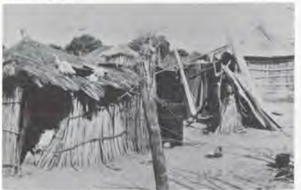
Old homes for lepers.

These words express the over-whelming joy of the lepers of the Yuka Village of Kalabo, Zambia, in Africa. Of the 120,000 people living in the semi-desert African plains of Kalabo, 4,000 are estimated to be lepers. They live in old filthy little huts, with no protection from rain, cold, or sun. Thanks to the dedication of the SAWS representatives many are now living in new homes. Paul Giblett, SAWS Director of Zambia, reports that 190 new African-type homes with toilets, kitchens, and courtyards, have been finished.