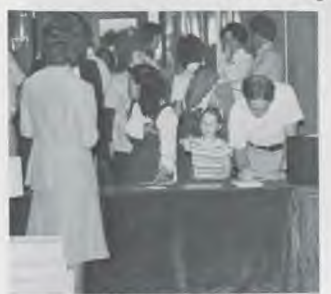
The hostesses at work.