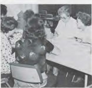
Tapes and records were available.