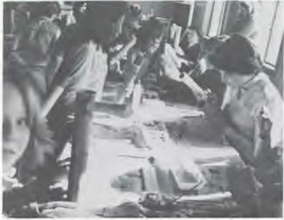
Students making totem poles as they studied Plains Indians.

Each day had a quiet hour when they relaxed, wrote, or just were quiet and listened to nature. Good healthful meals were served, and there was a daily recreation period. At night there were programs such as first aid, gym-