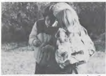
Students checking a compass for the orienteering course.

Each day had a quiet hour when they relaxed, wrote, or just were quiet and listened to nature. Good healthful meals were served, and there was a daily recreation period. At night there were programs such as first aid, gym-