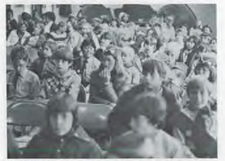
Pathfinders listening to an exciting story.

the feature film, "Big Red." Saturday night was warmer!