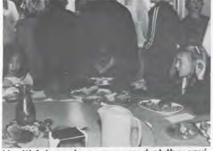
Healthful meals were served at the environmental school

nastics, hayride, worship, or study. The weather was excellent and all 58 sixth graders had a great learning experience.