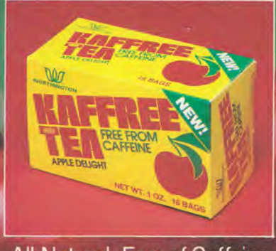
All Natural-Free of Caffeine