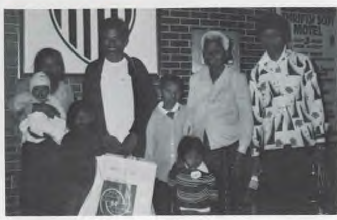
The Cambodian family which the Duluth Church is sponsoring.

In response to the text, Matthew 25:34-40, the Duluth Seventh-day Adventist Church decided to step out in faith with a decision to sponsor a refugee family. The appeal came through an area coordinator for Church World Services. With the appeal came background data stating the family size and ages of the members. The church decided not to request any specific family, but prayed that God would guide in the selection of the right family for them.