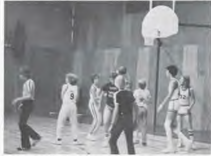
A basketball game between current and next year's academy students.

Days. The next few days would be packed with action, every minute bringing something new and challenging.