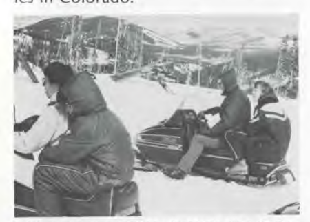
Riding snowmobiles through the Colorado Rockies was a thrill for the blind campers in attendance during the National Camps for Blind Children winter

Bringing their snow boots, heavy coats and energy, visually impaired campers attended National Camps for Blind Children's third annual winter camp at the YMCA Camp of the Rockies in Colorado.