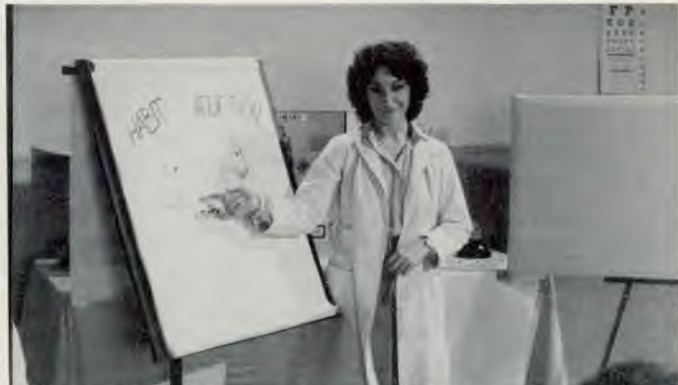
"The Quitters" won a Silver Award at the Houston International Film Festival.

Some local pastors are beginning to get this kind of response from their own communities where they are going on television with the localized Westbrook Hospital program, which is now available to qualified pastors and church members.