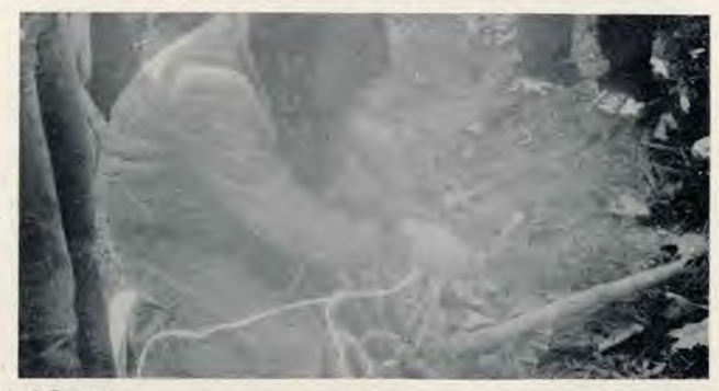
Hillcrest School Camp