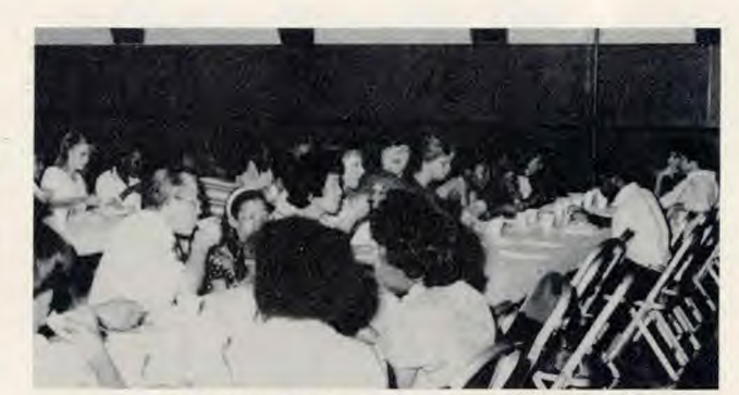
Parents learned about nutrition at the dinner.