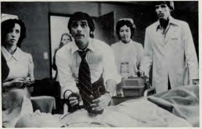
Faith For Today's Westbrook Hospital is seen on 110 broadcast stations, five Christian satellite networks, and dozens of cable outlets every week.

Temple" which tells one woman's experience in losing weight.