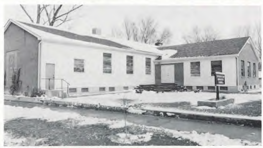
The present church building in Delta, Colorado. The elementary school occupies the right wing of the building.