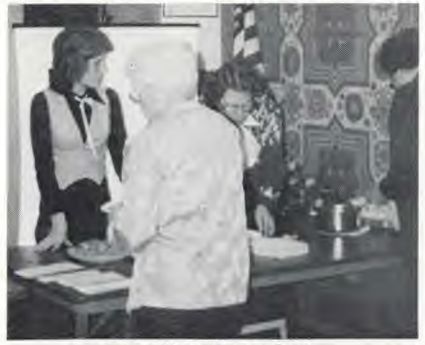
Sampling the recipes.