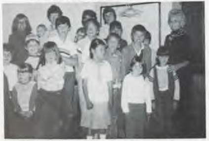
Eighteen boys and girls attend the story hour at Grassy Butte.