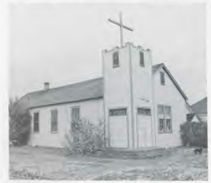
The first church built in Delta still stands at the corner of 2nd and Dodge Streets. It is presently serving as a food distribution center.

The attendance for the anniversary celebration was the largest ever seen in the Delta church. Two hundred fifty persons gathered in the sanctuary for