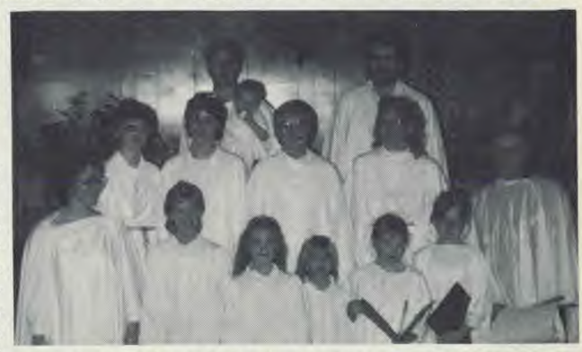
Interlakes SDA Church Christmas program—December 18, 1984.

At the close, guests enjoyed fellowship, hot chocolate, and Christmas goodies served in the basement. Some of the Senior Citizens received Christmas stockings made by the children of Interlakes Sabbath School.