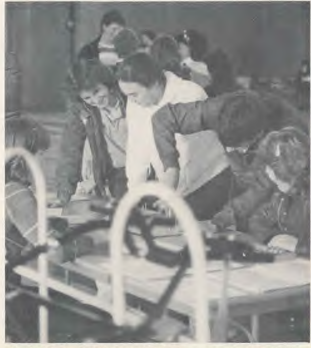
Students participating at a fair booth during Academy Days.

After supper, a film was shown, followed by visiting time in the dorms. Monday morning was spent visiting classes and meeting faculty, and at noon it was time to say good-bye.