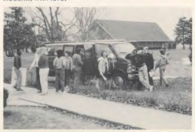
Students are checking out the new Dodge van which will be used by Sunny dale Academy for seminar groups and home leave.

Members throughout the Iowa-Missouri Conference support the operation of Sunnydale Academy and Christian education on a regular basis through Conference Advance, a part of the Personal Giving Plan. Some (well over 100 of them) go the extra mile and as members of New Horizons help to provide very special things...things like a salad bar, skates and recreational equipment, typewriters, washers and dryers for the dormitories, music department equipment, items for the home economics and industrial arts departments, a new 1985 Dodge van...all to the Sunnydale students, with love!