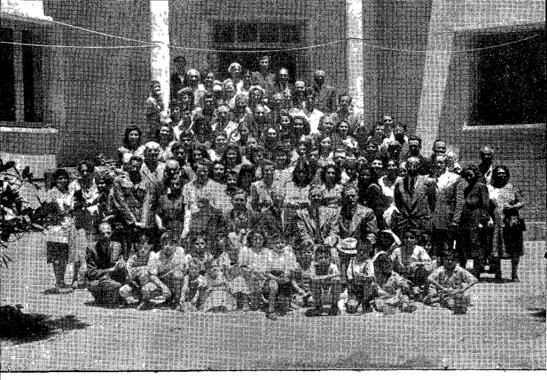
WORKERS AT TEHRAN CAMP MEETING