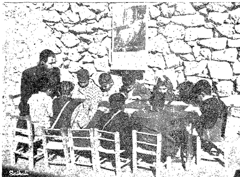
The Sabbath School is for the children as well as for adults

Let each Sabbath School leader and member ask himself, "What am I doing this year to help meet the Sabbath School goals?" God is looking to each one to do his part in helping to double our church membership. This is the greatest of all goals, for the purpose of giving the gospel is to save souls. Soon the work will be finished, and then the only thing we can salvage from this world will be the men and women who have been saved by the grace of God. Any department in the Sabbath School not working to that end is failing