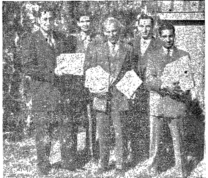
The Voice of Prophecy Staff in Egypt with one day's mail.