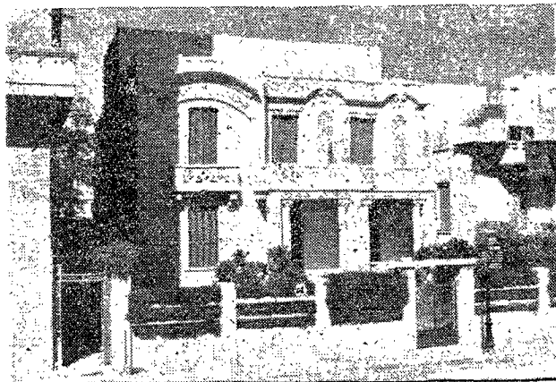
Adventist Auditorium Alexandria, Egypt.