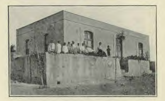
ABYSSINIAN MISSION HOME, EAST AFRICA

The best interest was shown from the very first, and there appeared a real desire to receive light. At the time of our meeting in Assiout representatives of the neighborhood