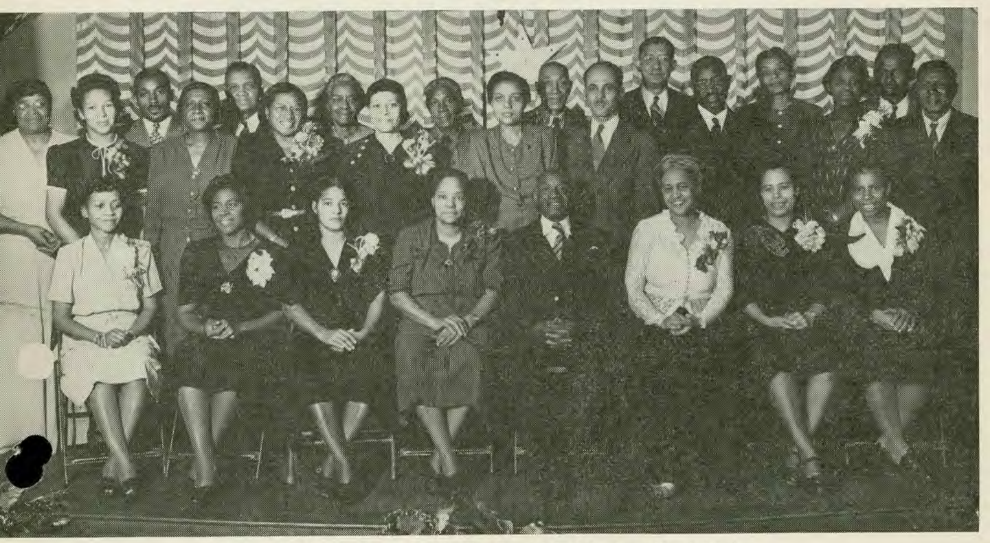
Rainbow Choral Club, Berean Church, That Donated $700 for Large Church Window