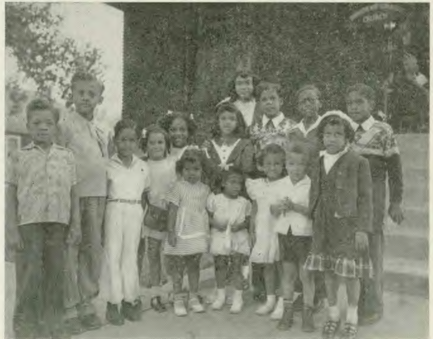
Group of Sabbath School Children, Salt Lake City, Utah

"TODAY is the tomorrow you worried about yesterday, and all is well."