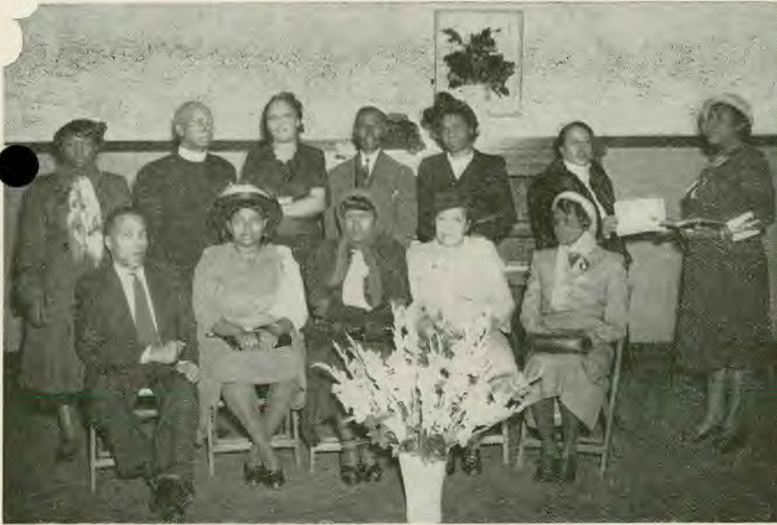
Group Who Recently Took Their Stand as a Result of the Bible Correspondence School, Shiloh Church, Chicago, Illinois