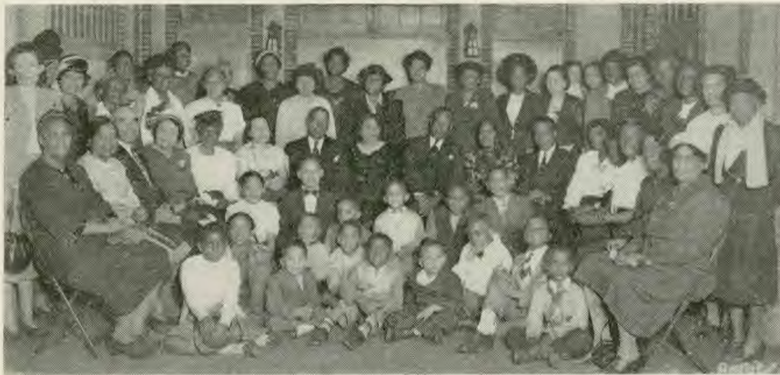
Investment Rally Group, Shiloh Church, Chicago, Illinois

school. This we feel is the main reason why the work of the school is so successful.