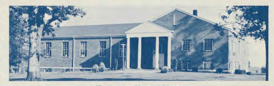
W. H. Green Memorial Library

As graduates of Oakwood go forth to serve the cause in various parts of the world, it is reassuring to know that your gifts are helping to make their service possible. The gifts of our faithful friends are deeply appreciated by the college, and the Lord marks and blesses the sacrifices for His cause.