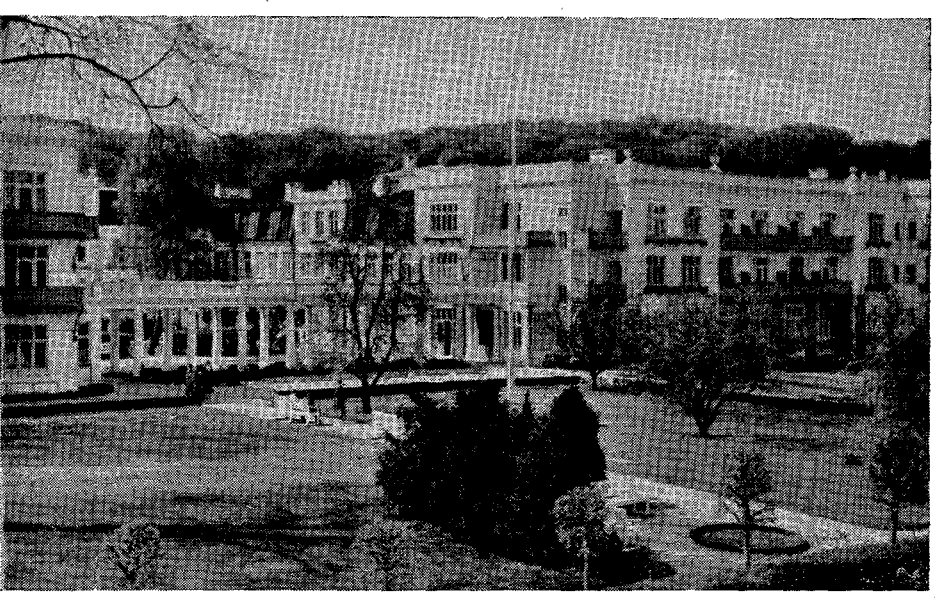
The Beautiful Sanitarium In Skodsborg, Denmark.