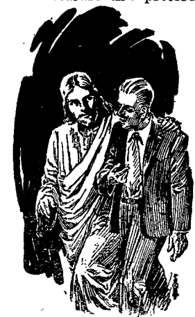
A Closer Walk A Richer Fellowship A Mightier Witness

And has it ever occurred to you what a wonderful opportunity our system of organization affords the development of this richer fellowship? Here we come to meet in annual association with brethren from so many and varied countries; we differ in language, nationality, customs, and sometimes our countries are separated by war, yet we ourselves are bound together in one great, united family. Let us protect and treasure this precious fellow-