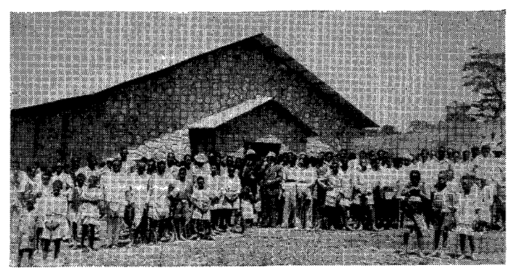
A group of churchmembers attending the weekend district meetings at Kuyera, Ethiopia.

Sunday, three Master Guides, three (Concluded on back page.)