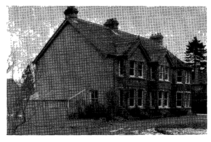
"Crossways" — a new residence housing, at present, six married couples and their children.

early May. The status of the plan was announced at graduation and I am happy to tell you that five three-year graduates (two of the current year and three of former years) who were definitely planning to go to America are with us at the College this year. You may be surprised to learn that we anticipate eight degree graduates at the close of this school year. As we go along into the future the affiliation with Washington Missionary College should bring a good deal of stability into the school planning of our young people. The fact that they can complete the four-year programme at Newbold and then for graduate work have the assurance that they may enter our own seminary or other American colleges without penalty or handicap will bring a feeling of security in their educational plans.