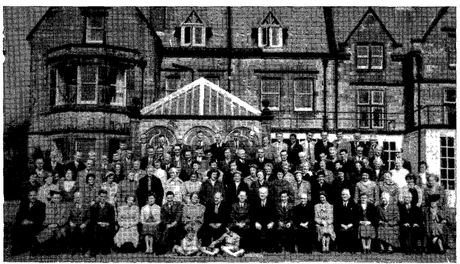
British colporteurs with their leaders assembled for their 1957 Council at Swanwick, Derbyshire.