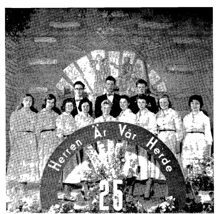
The 1957 Graduation Class at Ekebyholm in Sweden with their Motto: "The Lord Is Our Shepherd."

at Nyhyttan, spoke on her memories during the past quarter of a century. At the close of the meeting the students received their certificates, scholarships, and premiums.