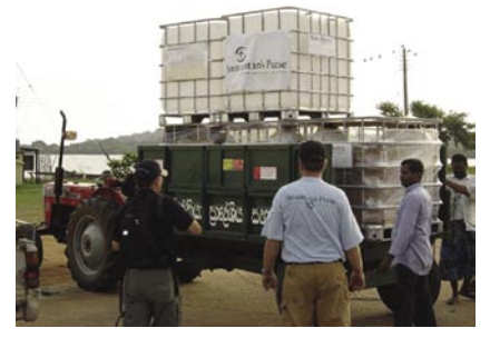
ADRA Sri Lanka preparing to deliver potable water

1. ADRA Myanmar is planning to distribute food to about 10,000 people for approximately six months.