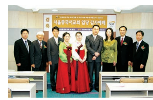
Chinese language Church Planting

of the earth, because Jesus bought the church with His own blood."