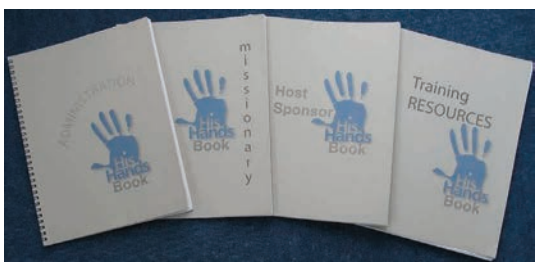
His Hands Handbooks

Four manuals are being developed to carry out this program: an administration manual, a manual for the missionary, and a manual for the host/ sponsor, and a training resource manual. The program will be launched at the autumn council of the GC this year.