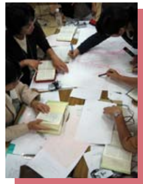
Grace Links, page 12