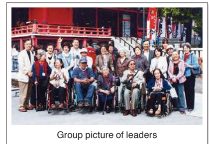
Group picture of leaders

With 78 members, these leaders are active in sending out 4,500 copies of a magazine called Bambi to the churches and supporters 3 times a year. The members go out on visitation, send out letters, cards and call on the telephone to assist members. Assistance is given to the churches to help the orthopedically handicapped members to be barrier free by providing ramps and seat elevators to help at their local church.