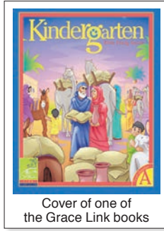
Cover of one of the Grace Link books

The advertisement read, “Bring back the joy into Sabbath School.” In January 2010, the Japan Union Conference will be ready to put on sale the Grace Link books for the Beginner and Kindergarten levels. These books are in full color and parents are encouraged to use them for bedtime stories, family worship through the week and to teach the songs that accompany the lessons to their children. Sabbath School teachers are assured that these new books will be easy to use, taking them through from the introduction to the teaching and the application of the lesson with many interesting approaches to be selected from a number of options every week.