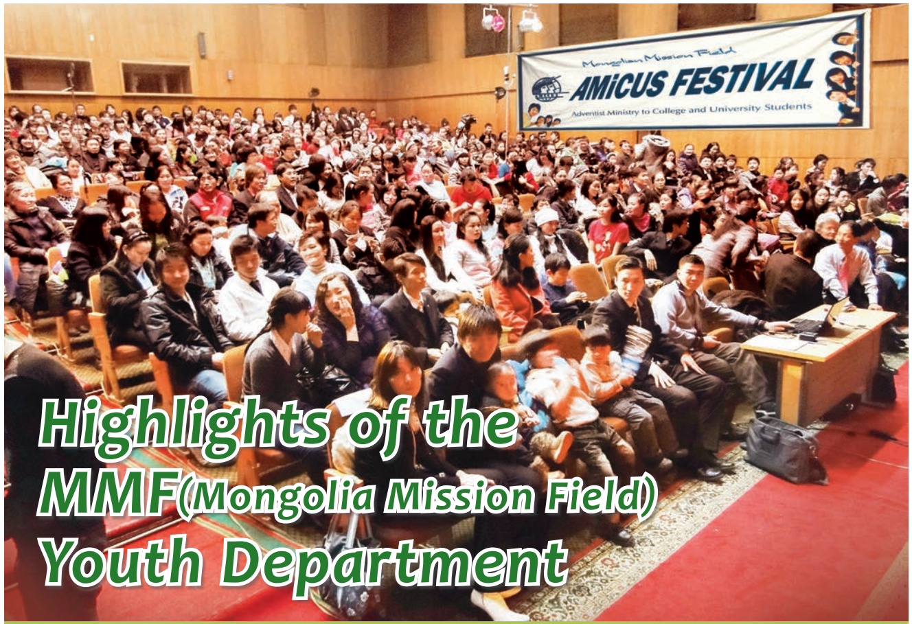
▲ Jam-packed with Mongolian people for the event of Korean musical team and AMICUS