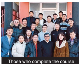
Those who complete the course