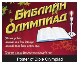
Poster of Bible Olympiad