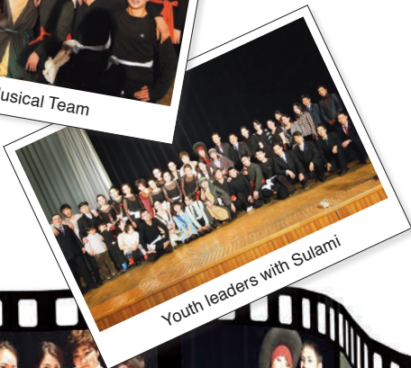
Youth leaders with Sullami