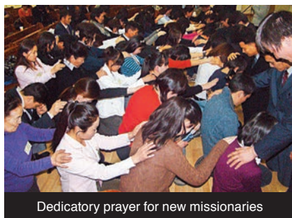
Dedicatory prayer for new missionaries