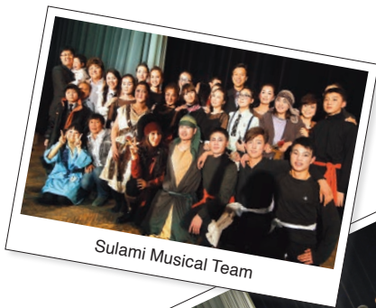
Sullami Musical Team