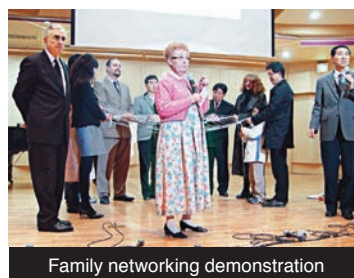
Family networking demonstration

This made the cold wintry Sabbath not so cold after all.