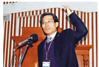
Question and suggestion