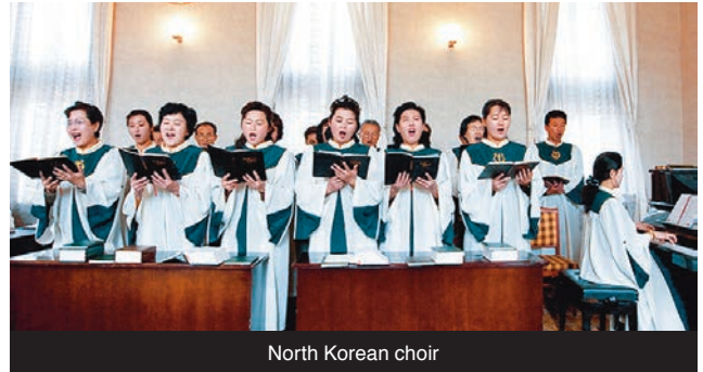
North Korean choir

As the world church expresses greater interest in North Korean mission work, the NSD decided to publish a North Korean Mission Magazine in order to cater to these needs. The magazine will provide a variety of information and present mission strategies. The NSD works in different ways towards its end in mission work in North Korea. There are a number of limitations and a plethora of barriers to spread the gospel. Despite few reports due to the sensitive nature of our situation, the NSD steadily works to help North Korea in cooperation with several organizations and individuals related to North Korea. Some of these endeavors brought positive results. Finally, a regular publication is ready to unveil our mission work in North Korea albeit in a limited way.