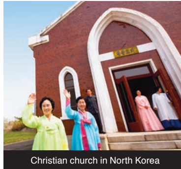
Christian church in North Korea