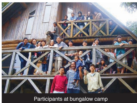
Participants at bungalow camp

After worship on Sabbath all were free to relax and enjoy a barrier free environment which led to opening hearts and discussing some issues in the church until deep into the night. This in turn resulted in better