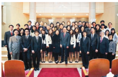
Final concert but their music ministry will be continued

They organized the final concert not only to celebrate the close of their one-year ministry, but also