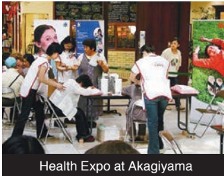
Health Expo at Akagiyama

A health expo was held at a huge shopping mall located in Maebashi City. Ten booths were set up and 133 guests participated in the day's events.