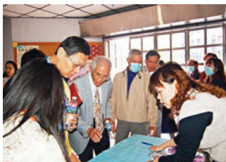
Registration of delegates