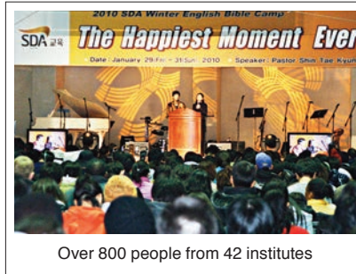
Over 800 people from 42 institutes

On Friday afternoon, 20 well prepared English seminars presented a practical help to our students. On Sabbath, the second day of the camp, 53 souls were baptized.