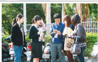
Street outreach of HisHands members