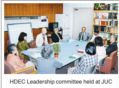
HDEC Leadership committee held at JUC

Excitement skyrocketed about the projected Union-wide convocation planned for the disabled in September.