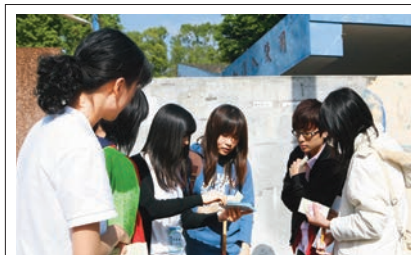
Korean HisHands use Chinese evangelism cards