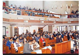
160 delegates attended

collaboration with institutions in Taiwan. Other benefits were enhanced self-governance and responsibility, better utilization of ministries and resources, localized ministry strategies, less politically sensitive and more centralized ministries in Taiwan.