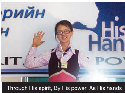
Through His spirit, By His power, As His hands