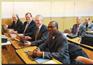
The BRI scholars