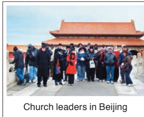
Church leaders in Beijing