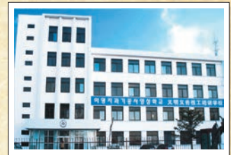
Euimyung building in Yanji, China

sporadic mission works for North Korea united around the committee. The Center plans to publish a newsletter about mission in North Korea from March 2010. This will help deliver news to church members, to solicit their prayers and support for North Korea. The NSD plans to support and train North Korean defectors, living in the South and research more effective mission strategies for North Koreans in cooperation with Adventist defectors.