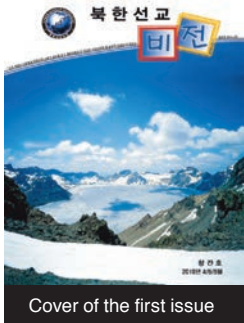
Cover of the first issue