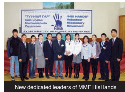
New dedicated leaders of MMF HisHands