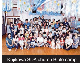
Kujikawa SDA church Bible camp

could see the fruits of their humble beginnings today! Kujikawa Church was organized as a church on July 22, 1909 with only 11 members.