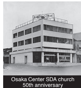
Osaka Center SDA church 50th anniversary