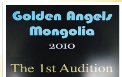
Audition gives youth ambition