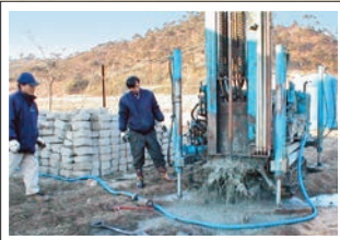
The farm drilled four wells