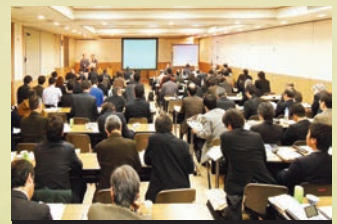
It enriches participants theologically