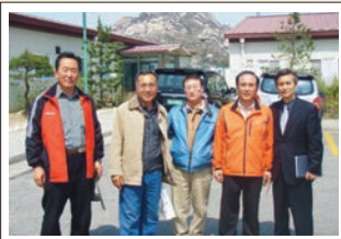
The members of Council visit North Korea