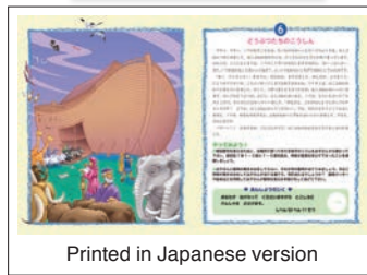
Printed in Japanese version

Indeed, we pray that the children of Japan will be linked to God’s grace and experience the love of God in their lives through these well-developed lessons.