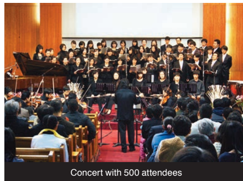
Concert with 500 attendees

guest performers. The second part of the program was performed by the Seoul English Institute Church's very own choir. Despite the economic difficulties, many private businesses and groups and members of the Seoul English Institute Church gave generously. The Seoul English Institute Church is planning to carry out 'love your neighbors' projects to show the practical love of Jesus through service and love.