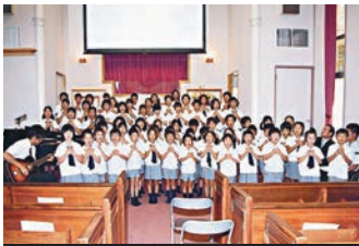
Kisarazu SDA Church Children's Worship

Elementary children from Kofudai Saniku Elementary School presented a special "Kids Church" including the message presented by their loving