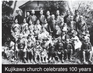
Kujikawa church celebrates 100 years

Kujikawa Church celebrates a century of outreach. How blessed would the founders feel if they