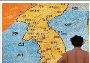
IN order to organize the support system in North Korea