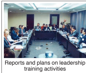
Reports and plans on leadership training activities