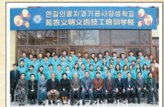
Students and staffs of the Denture Manufacturing Corporation