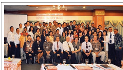
Group picture of participants