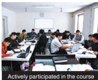
Actively participated in the course

in Pastoral Care and Counseling and Expository Preaching are planned for August and November.