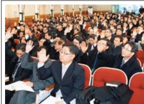
Delegates support new leadership

The reorganization of church structure was approved at each session. It showed that most members are eager to fuel new evangelistic revival through a change in structure.