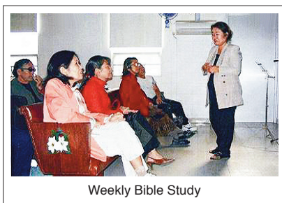
Weekly Bible Study

The group also help edit the Braille Sabbath School Guide produced by the Sabbath School Department.