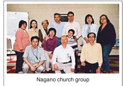
Nagano church group

With a membership of approximately 60, the group is active in personal spiritual activities such as campmeeting once a year in late spring, a fall picnic which was held at a beautiful rose garden, a Christmas party and a spring nature adventure to the beach as seen in the picture. Weekly Bible study in sign language is lovingly presented for these members.