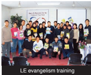
LE evangelism training