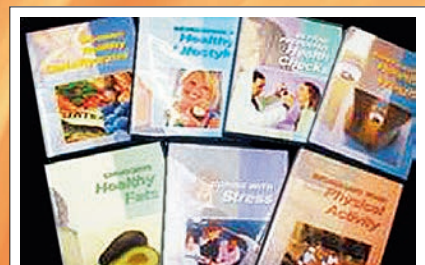
DVD Health Living Series

Local church leaders can use these DVD's as a tool for their ministerial work.