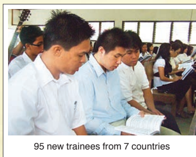
95 new trainees from 7 countries