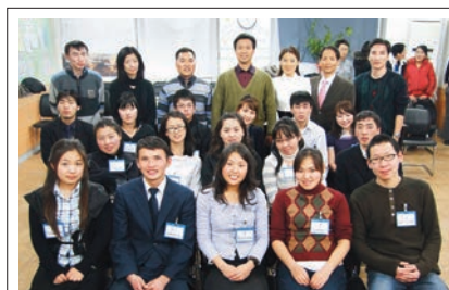
Applicants and the panel of judges