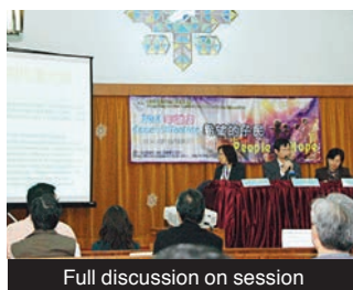
Full discussion on session