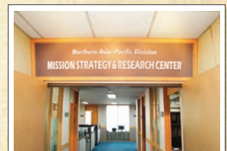
NSD Mission Strategy Research Center for North Korea mission