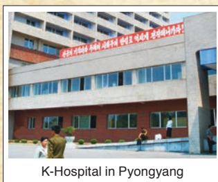
K-Hospital in Pyongyang

NSD had signed an agreement to send medical supplies, with K-Hospital in Pyongyang, North Korea, in June, 2006. It has continued its humanitarian relationship by providing medical aid. K-Hospital is a general hospital equipped with the most modern facilities. The hospital has over 30 clinical departments including cardiosurgery and neurosurgery and 15 function-diagnosis and test departments equipped with the most advanced diagnosis and testing facilities in the