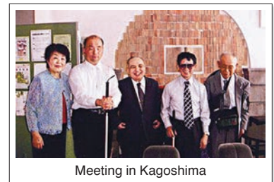
Meeting in Kagoshima

Begun in 1976, this devoted group prepares 4,300 copies of a magazine named Apata for distribution every 3 months.