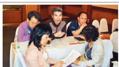
Group discussion and brain storming

There was also the recommendation that each Division starts a chapter of the Adventist Student Personnel Association (ASPA) to continue on the education of residence deans and also to bring to the deans an Adventist organization for fellowship, mutual learning and support of the deans as they grow professionally and enhance the educational work of all schools within the Divisions.