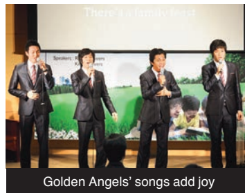
Golden Angels' songs add joy