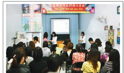
Good opportunity to connect with neighbors