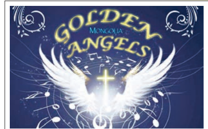
Logo of Mongolian Golden Angels

We believe that through this project our young people will be trained for service and the churches will be energized. Lastly, our Youth department is expecting great things to happen in the future.