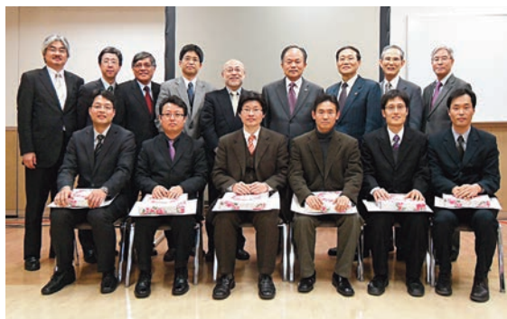
Well done, good and faithful servants

During the Bible Conference at Tachikawa in Japan, pastors from throughout Japan attended. Among them Korean PMM missionaries also participated.