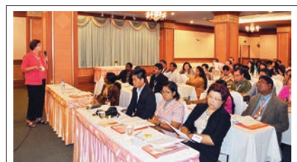
Participants catch a renewed vision of their deanship