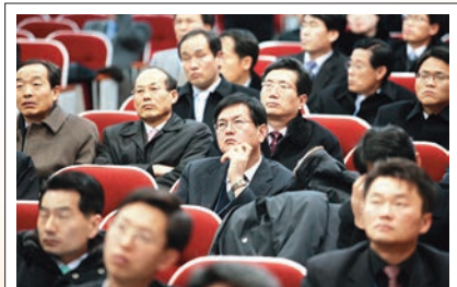
Concentration and attention