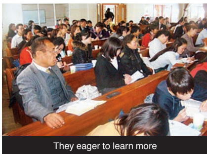
They eager to learn more