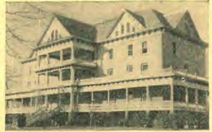
Iowa Sanitarium and Hospital "The Health Center"