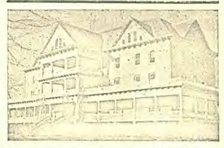
Iowa Sanitarium and Hospital "The Health Center"