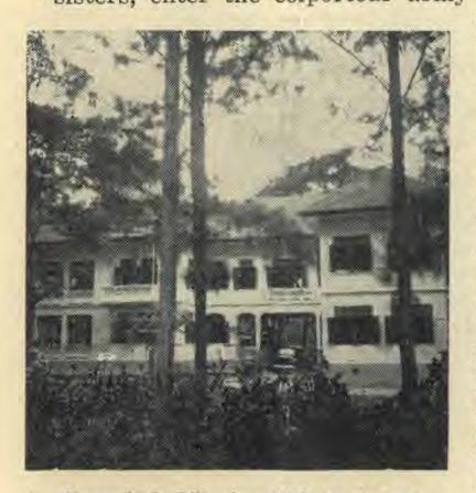
Bangkok Mission Clinic Annex

"THE GOAL OF ALL GOALS IS SOUL WINNING." The literature ministry is our medium in saving souls. We need many more colporteurs. Brothers and sisters, enter the colporteur army