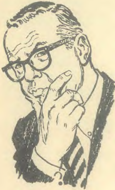
PROBLEMS IN HUMAN MISBEHAVIOUR—4