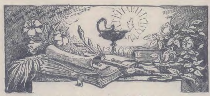
____In the School of Christ.

SCIENCE WITH THE BIBLE, AND WITHOUT THE BIBLE.